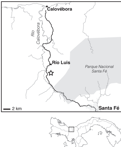
Figure 1. Sampling locality (indicated by the star); black line represents the carretera Guabal–Río Luis–Calovébora, shown at its extent in August 2019.

We established a single field site (08°35'52.8"N 81°12'21.6"W; 170 m elevation) near the town of Río Luis. Vegetation at this site consists of disturbed mature pluvial forest. We exclusively used mist-nets to collect birds. On the final day we used playback to target a few focal, widespread species for comparative genomics work. In total we collected 80 specimens, deposited in the Smithsonian Tropical Research Institute (STRI) Bird Collection,